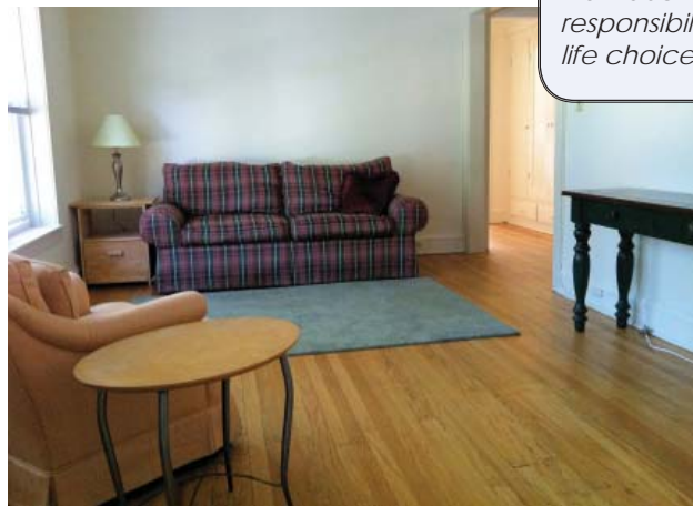
Scattered site apartment leased by Housing Options.

Housing Options also offers a range of mental health and daily living skills groups. Groups build on skills developed with case managers and offer clients the opportunity to work together to develop specific recovery and daily living skills that interest them. Also available are a range of group activities such as a writing group, monthly group dinners, and volunteer opportunities. These activities help to acclimate our clients and provide them with a first step towards entering community life independently.