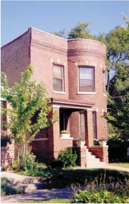
Claire House, one of Housing Options six residences.

and medication management training, independent living skills support and housekeeping skills training. For clients unable to find an affordable psychiatrist with whom they are comfortable, Housing Options also provides psychiatric services. Clients meet with Housing Options' consulting psychiatrist for counseling and medication monitoring as needed.